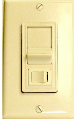
Model: PLV-LED-5 (Shown in Ivory)